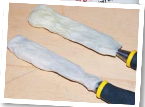
▲ The 25mm (bottom) chisel is wrapped in water-soaked paper, the 32mm in HoneRite Gold-soaked paper